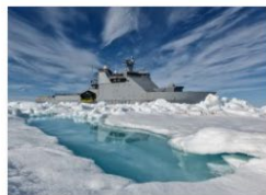
3 plass NF Håkon Kjølmoen Norge.JPG