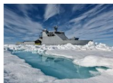
Hederlig omtale 2016 Håkon Kjellmoen .JPG