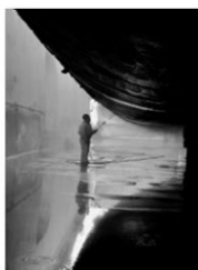
Hederlig omtale NF - Marika West Finland.jpg