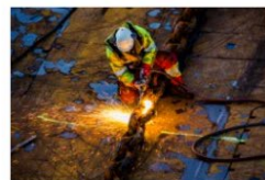
4 plass NF - Bjarne Hovland Norge.jpg