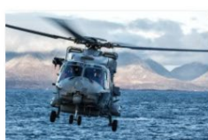
Hederlig omtale 2016 Håkon Kjellmoen .JPG