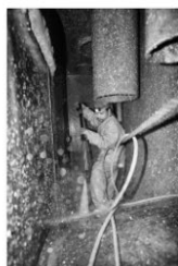
2 plass NF - Jörgen Språng Sverige.jpg