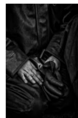
5 plass NF - Jörgen Språng Sverige.jpg