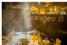
3 plass 2016 Norge Bjarne Hovland.jpg