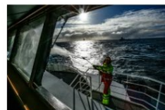
5 plass 2016 Norge Håkon Seim.jpg