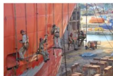
Hederlig omtale 2016 Vidar Strønstad .JPG