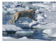
Hederlig omtale 2016 Håkon Kjellmoen.JPG