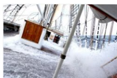
Hederlig omtale 2016 Berit Bye.jpg