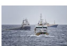
Håkon Kjølmoen .JPG