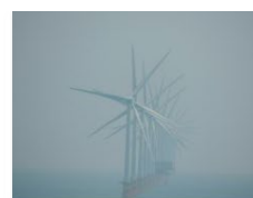
Geir Magne Skjølvik.JPG