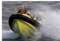
Håkon Kjølmoen .JPG