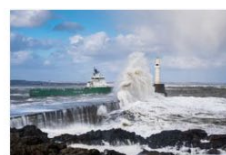
5 plass 2018 Frode André Koppang - Norge.jpg