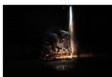
3 plass 2018 Johan Byström - Sverige.jpg