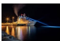
Håkon Kjølmoen .JPG