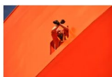
4 plass 2018 Claus Jacobsen - Danmark.jpg