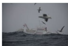
2 plass 2018 Bergþór Gunnlaugsson - Island.jpg