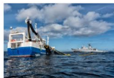
4 plass 2018 Håkon Kjølmoen.JPG