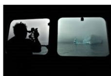
1 plass 2018 Guðmundur St. Valdimarsson - Island.jpg