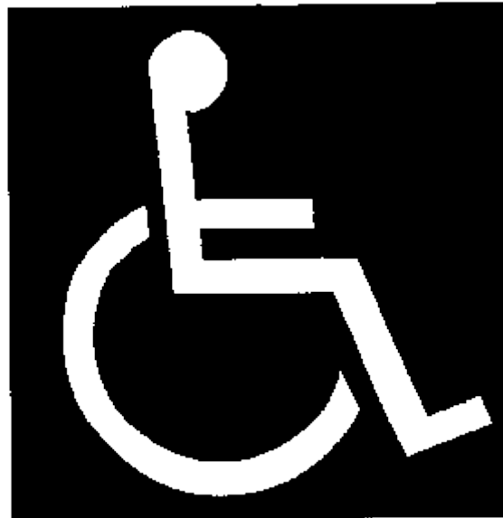
Signs indicating equipment, installations and facilities suitable for disabled persons.