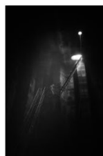
4. plass nordisk 2020 - Jörgen Språng - Sverige.jpg