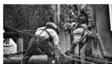
Hederlig omtale nordisk 2020 Kristján Birgisson - Island.jpg