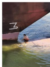
Hederlig omtale 2020 Steinar Lilleskare Hurtigruten.jpg