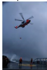
Hederlig omtale 2020 Henning Solberg KV Sortland.JPG