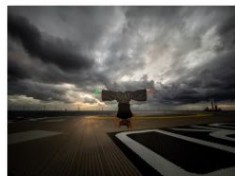
2. plass 2020 Håvard Melvær Edda Fjord.jpg