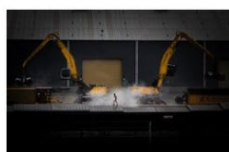
Hederlig omtale 2020 Håvard Melvær Edda Fjord.jpg