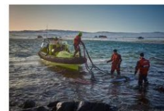
5. plass 2020 Knut Sandholm Jenssen KV Nordkapp.jpg