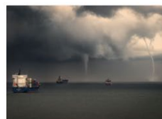
Hederlig omtale 2020 Håvard Melvær Edda Fjord.jpg